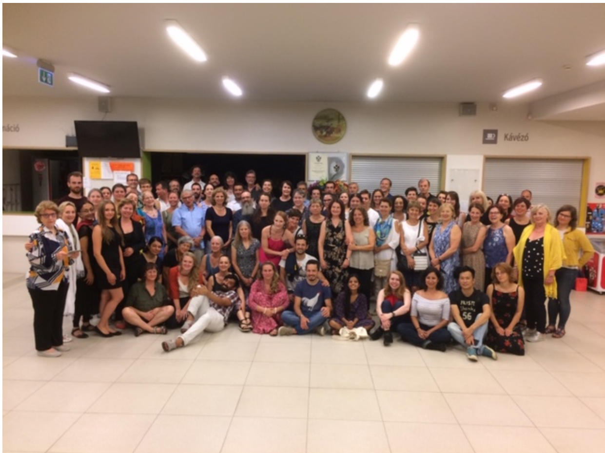
Participants of the 30th Symposium of the ICTM Study Group on Ethnochoreology. Szeged, Hungary, July 2018.