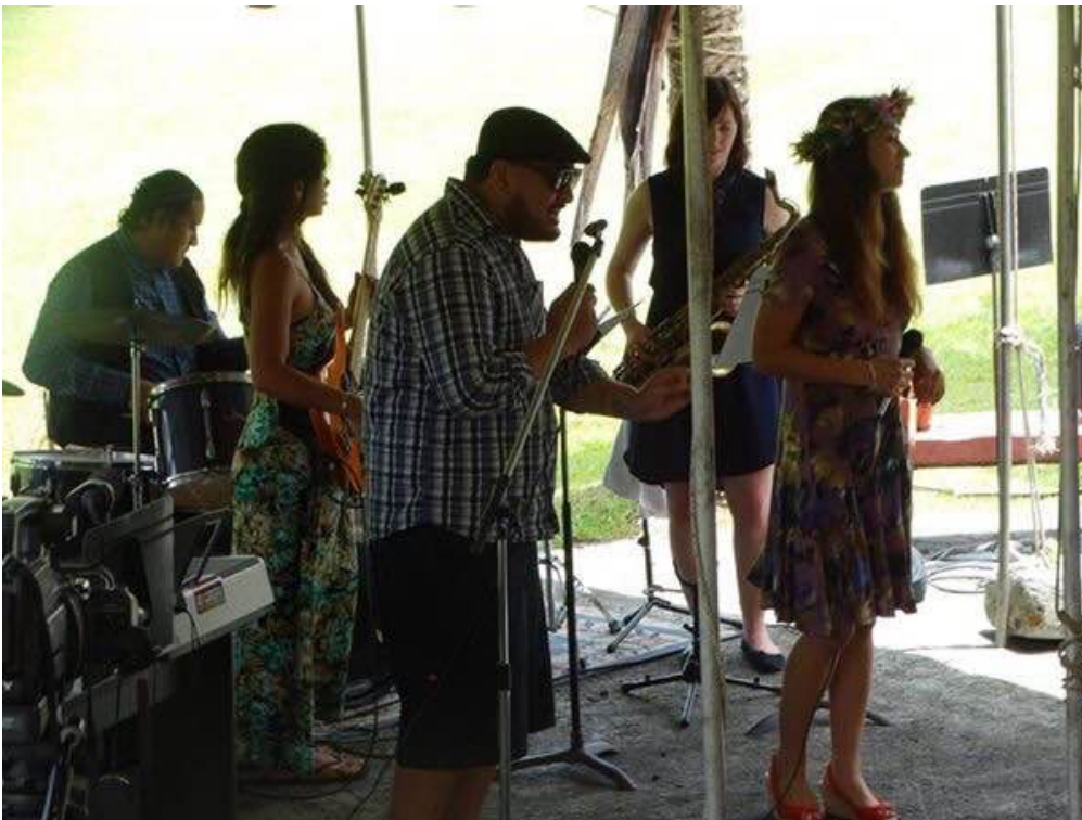
The Opeloge Ah Sam Quintet performs for the Fine Arts Jazz Week Festival at the American Samoa Community College. The Jazz week festival coincided with the island wide Samoana Jazz & Arts Festival in American Samoa.