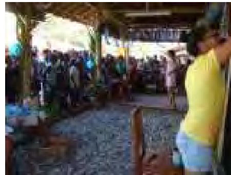
People gathering to the Palauan booth