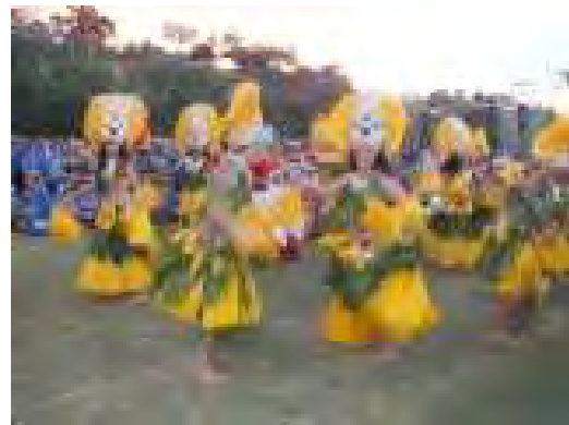
French Polynesia, Photo by Manami YASUI