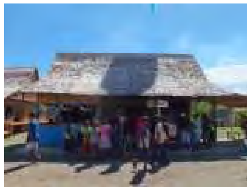
Booth of Palauan Delegation in the Festival Village, Photo by Manami YASUI