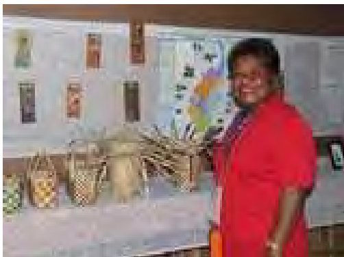
Demonstration of weaving