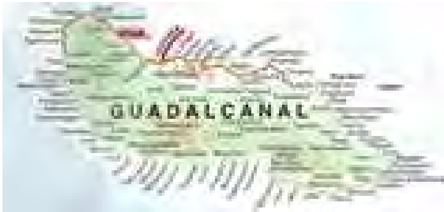
Map1: map of Guadalcanal Island