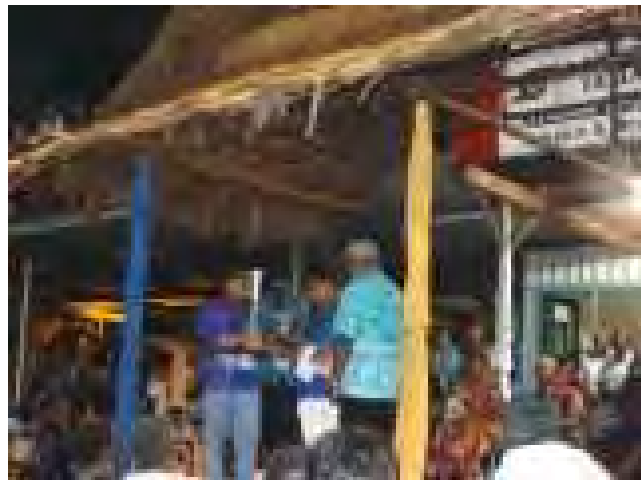
Short performance of Palauan dancers, Photo by Manami YASUI