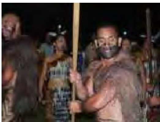
Maori (New Zealand)