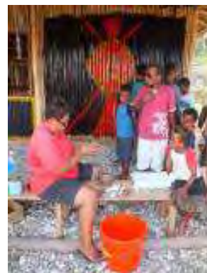
Demonstration of ceramic art