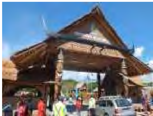
Gate of the Festival Village