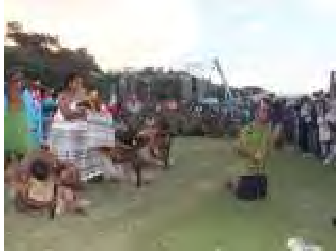
Fiji, Photo by Manami YASUI

(American Samoa, Australia, Cook Island, Easter Island, Fiji, French Polynesia, Guam, Hawaii, Kiribati, Nauru, New Caledonia, New Zealand, Niue, Norfolk Island, Palau, Papua New Guinea, Samoa, Solomon Islands, Tokerau, Tuvalu, [Vanuatu])