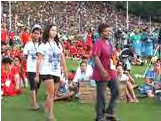
Palauan delegation members going to the stage