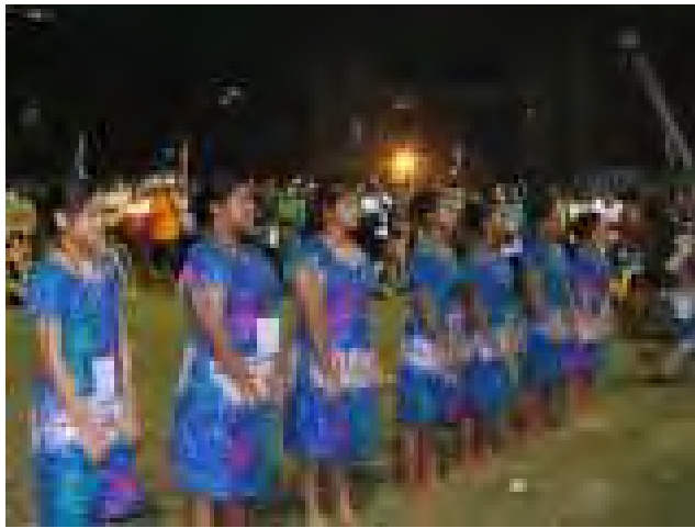
Gift from Palau to Solomon Islands, Photo by Manami YASUI

Gift ceremony of Palauan delegation for Solomon Islands and the short performance of Palauan dancers: